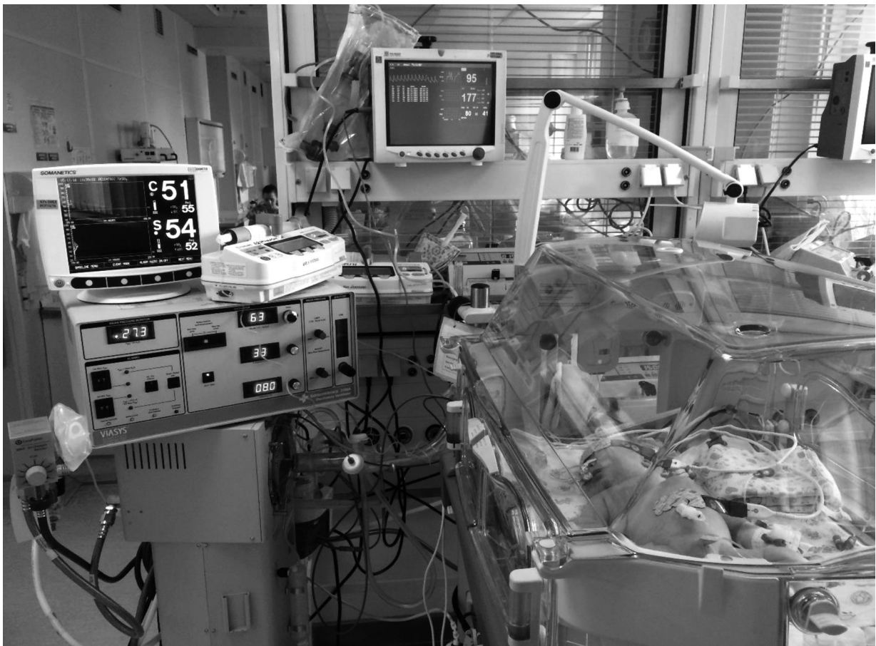
Fig. 1. Cardiorespiratory monitoring and probe positions during NIRS

in the oxygen extraction by the tissues due to higher oxygen consumption in relation to oxygen delivery, while a decrease suggests less oxygen use compared to the supply. This also relatively compensates for low arterial oxygen content, as is often the case in newborns with lung disease or congenital heart defects [7].